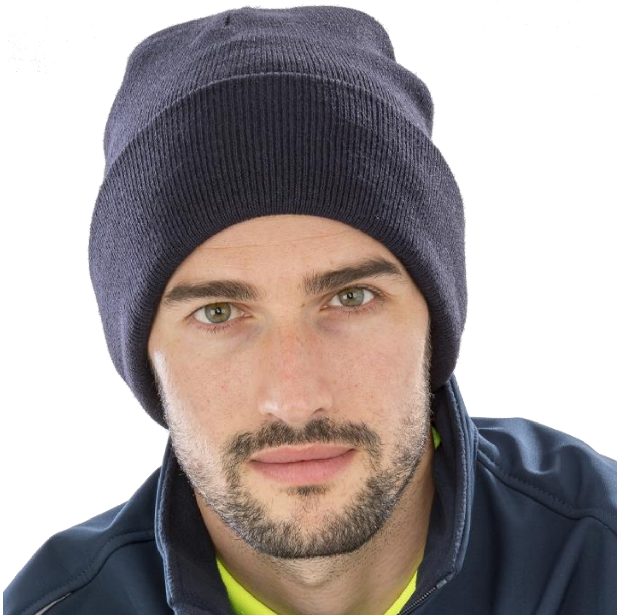
RC929X RECYCLED WOOLLY SKI HAT