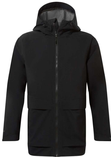
800 - Black