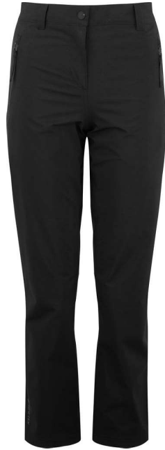
800 - Black