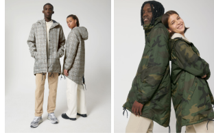
Padded Parker Tweed Padded Parker AOP

Shell : Plain Weave , 100% Polyester - Recycled , Fluorine-free DWR , 75 GSM Padding : 100% Polyester - Recycled , 100 GSM Lining : Taffeta , 100% Polyester - Recycled , 75 GSM