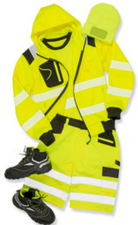
R503X RECYCLED ZIPPED SAFETY HOODY