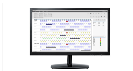
TimeMoto desktop software for single PC use included