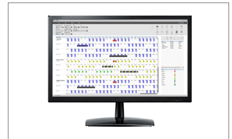
TimeMoto PC Software Plus Art.no: 139-0602