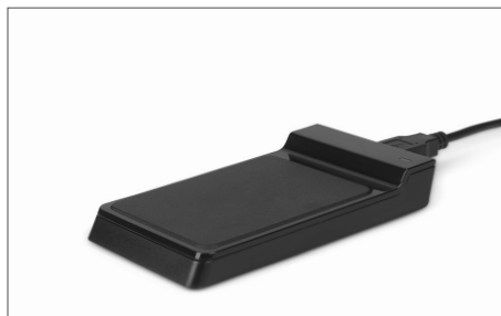
TimeMoto RF-150 USB RFID Reader Art. no: 125-0605