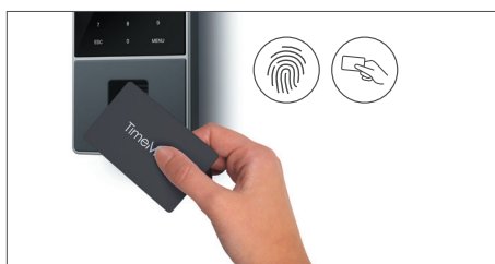
Clocking with RFID proximity card, Fingerprint or PIN code

* After the 30-day trial, choose your subscription: TimeMoto Cloud or TimeMoto Cloud Plus