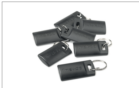
TimeMoto RF-110 set of 25 RFID key fobs Art.no: 125-0604