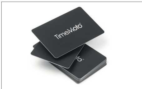
TimeMoto RF-100 set of 25 RFID badges Art. no: 125-0603