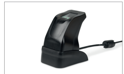
TimeMoto FP-150 USB Fingerprint Reader Art.no: 125-0606