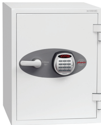
Titan II FS1273E