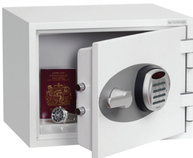
Titan II FS1271E