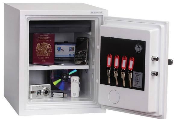
Titan II FS1272E