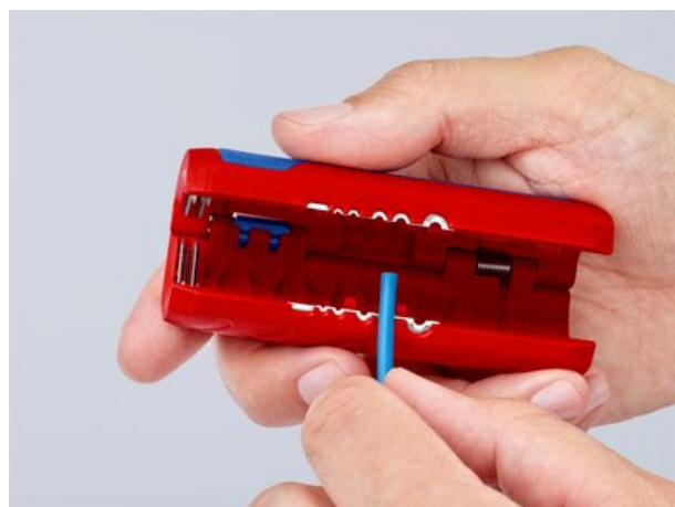
90 22 02 SB: Injection moulded length scale for consistent stripping to a uniform length, legible for left and right handed users