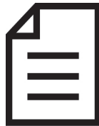
Declaration Of Conformity CE