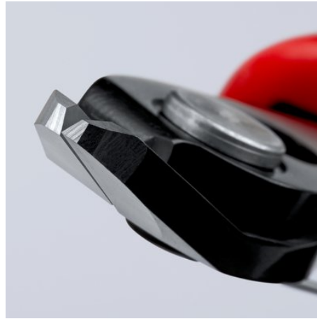
Shear cut with controlled micro cutting edge misalignment for the most precise cutting of even the thinnest of wires and for a long service life