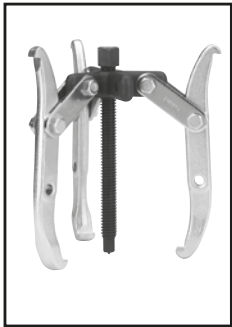
Triple long leg