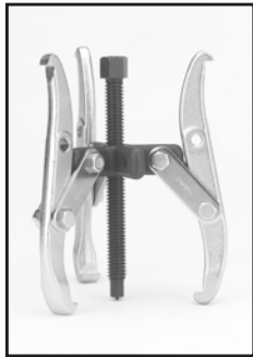
Triple short leg