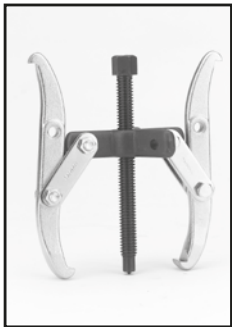
Twin short leg