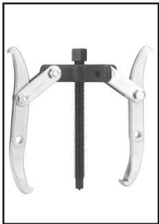
Twin long leg