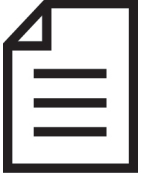
Material Safety Data Sheet