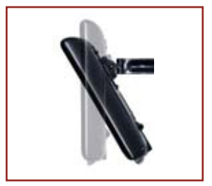
Pre-tensioned tilt mechanism offers up to ±35° of tilt

(800) 865-2112 (708) 865-8870 Fax: (708) 865-2941 www.peerlessmounts.com