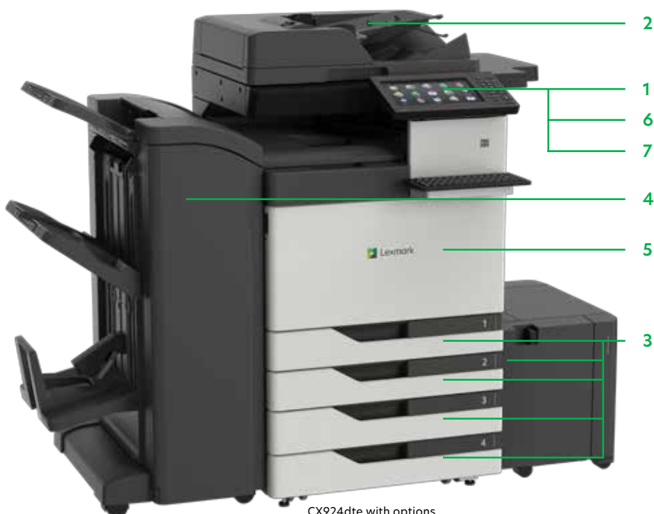
CX924dte with options

Print Microsoft Office files, PDFs and other document and image types from USB keys, or select and print documents from network servers or online drives.