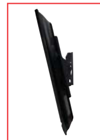
Pre-tensioned universal tilt bracket allows +15/-5° of viewing angle adjustment