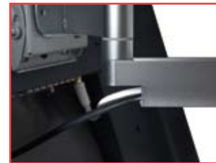
Built-in internal cord management channels