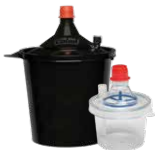
Snap Lid System® UV Art. no.. 9370xxxSLSUV