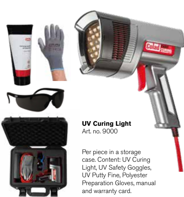
UV Curing Light Art. no. 9000

Per piece in a storage case. Content: UV Curing Light, UV Safety Goggles, UV Putty Fine, Polyester Preparation Gloves, manual and warranty card.