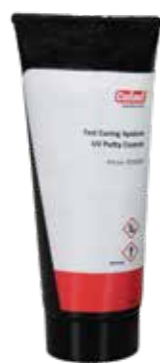
UV Putty Coarse Art. no. 915020

Per piece in a storage case. Content: UV Curing Light, UV Safety Goggles, UV Putty Fine, Polyester Preparation Gloves, manual and warranty card.