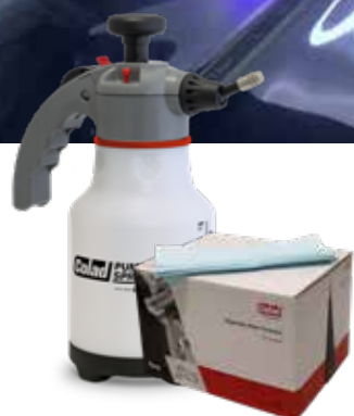
Pump Sprayer Ultimate Art. no. 9704