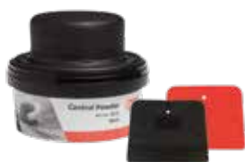
Control Powder Art. no. 8035