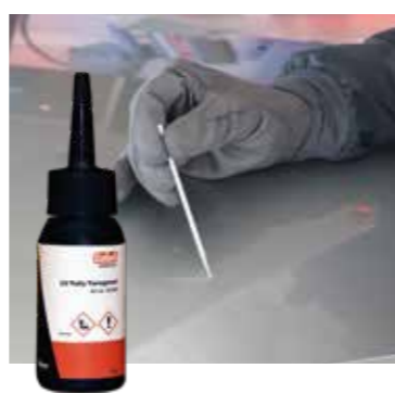
UV Putty Transparent Art. no. 915033

220 g tube For filling even the smallest micro holes