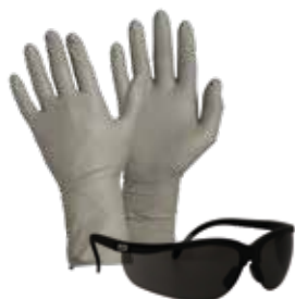
Nitrile Gloves Grey Art. no. 53820x