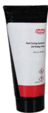
UV Putty Fine Art. no. 915011

190 g tube For filling small cracks, dents and stone chips