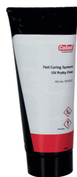
UV Putty Fine Art. no. 915011

190 g tube For filling small cracks, dents and stone chips