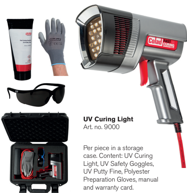
UV Curing Light Art. no. 9000

Per piece in a storage case. Content: UV Curing Light, UV Safety Goggles, UV Putty Fine, Polyester Preparation Gloves, manual and warranty card.