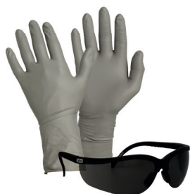
Nitrile Gloves Grey Art. no. 53820x