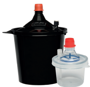
Snap Lid System® UV Art. no.. 9370xxxSLSUV