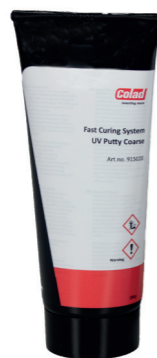
UV Putty Coarse Art. no. 915020

Per piece in a storage case. Content: UV Curing Light, UV Safety Goggles, UV Putty Fine, Polyester Preparation Gloves, manual and warranty card.