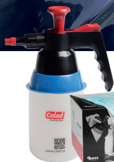
Pump Spray Bottle 1000 ml Art. no. 9705