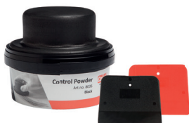
Control Powder Art. no. 8035