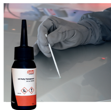
UV Putty Transparent Art. no. 915033

220 g tube For filling even the smallest micro holes