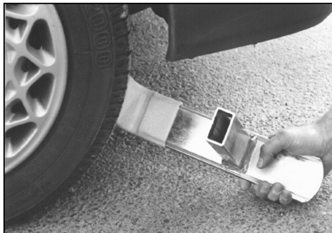
2. Position inner arm behind wheel, hook into rim.