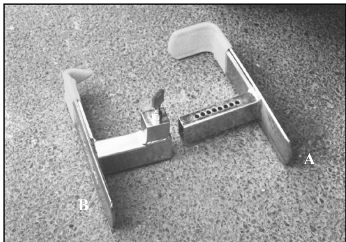
1. A - Inner Arm. B - Outer Arm.