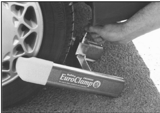
4. To remove clamp, insert key, rotate 1/2 turn, pull on key and/or press inner and outer arms together until lock pops out.

We have taken every care in the design and manufacture of this security device and we believe that it is an effective deterrent. However we cannot guarantee that it will resist the efforts of the most determined thief, and as such we do not accept any liability for loss or damage caused by theft, vandalism or other illegal activity against property to which this device is fitted.