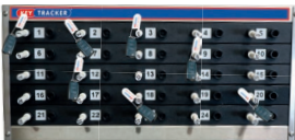
Mechanical 25 Peg Board