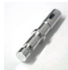
Metal Retaining Pegs