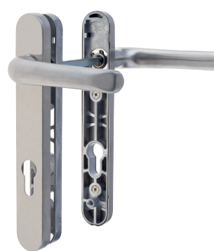
Brushed Stainless Steel