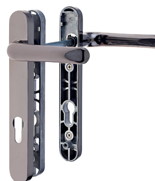
Smokey Stainless Steel