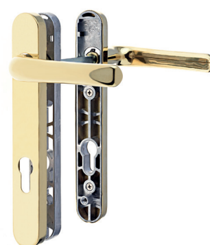
Polished Gold Stainless Steel