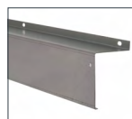
Galvanised Steel Fascia ( 40P/1850 )