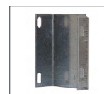
Galvanised Steel Fascia Endcap ( EC40P )

View our full range of door handles and flush pulls on pages 128 and 129.