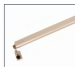
Easyclose Automatic Door Closer ( SC100 )