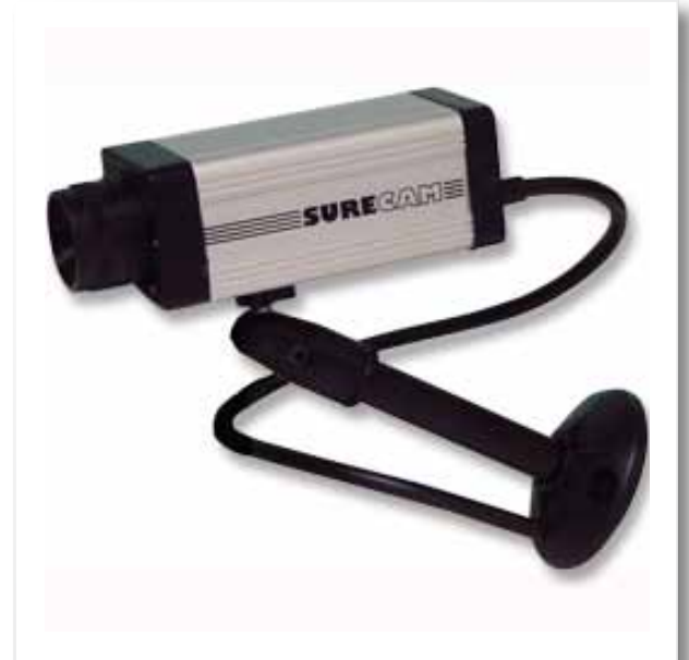
CD50 - Internal Decoy Camera