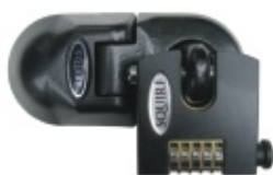
STH1 - Padbar CEN 6 rated

Sheds, garages, commercial vehicles, substations, perimeter gates, trailers, industrial premises, schools, clubs, storage units.