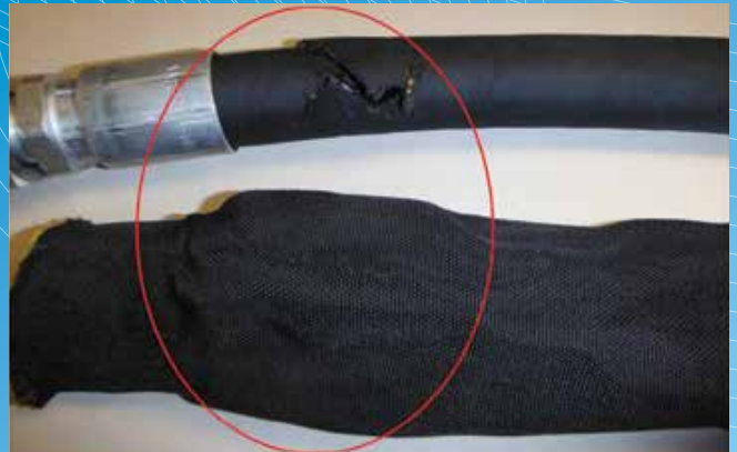
-16 Hose Specimen-4 No Apparent Damage to the Sleeve at the Hose Failure Location

IMPORTANT: BurstGard should not fit tightly on hose. Suggested clearance of 1"