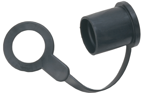
Plastic CAPS for MALE Couplings