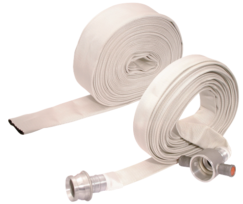
two-component lining system