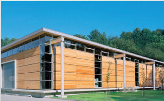
NiroSan® Press stainless steel fitting plant in Schmiedefeld near Dresden

More information in our complete catalogue or at www.sanha.com