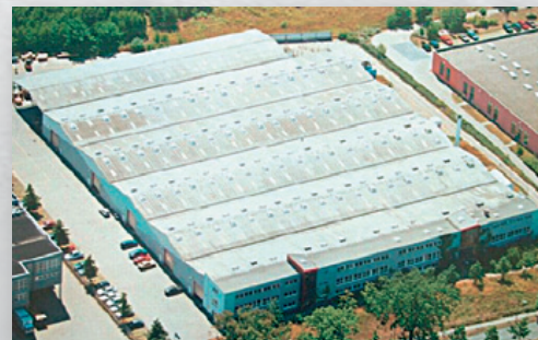
NiroSan® stainless steel pipe plant in Berlin

More information in our complete catalogue or at www.sanha.com