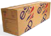
This product comes in a long box and contains 20 socks

These socks are 1.2 metres in length and eight centimetres in diameter. There are 20 socks in the branded cardboard box. The socks feature a spun-bond outer sleeve that has a durable heat sealed seam running its entire length. This tube is then filled with a next generation absorbent core that will absorb both oil-based and water-based fluids. The absorbent core is secured into the sleeve at each end with a durable plastic clip.