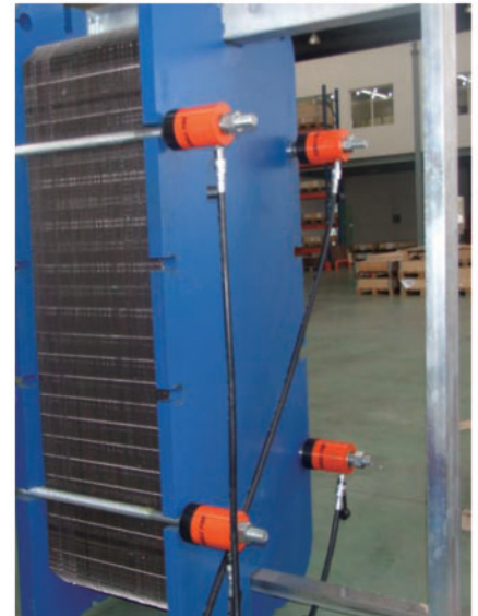
4 EAGLE PRO ESH-306 pulling threaded bar in a the largest heat exchanger in SONDEX's factory in Ningbo China.