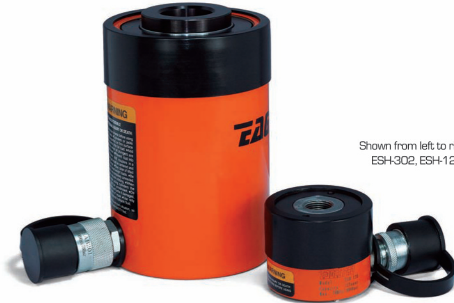
Shown from left to right: ESH-302, ESH-120