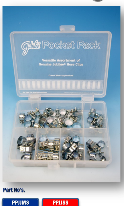
This valuable pocket pack contains 54 x Junior nut and bolt clips covering fittings from 7mm to 16mm.