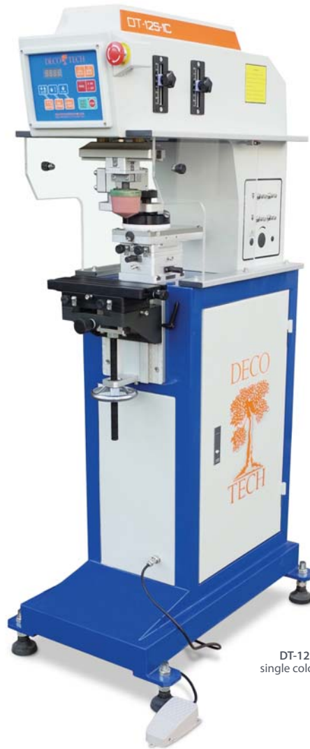
DT-125-1C single color model

ECONOMICAL SINGLE COLOR PAD PRINTING MACHINE