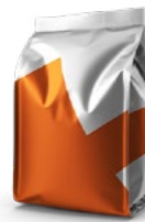
Quad bottom pouch