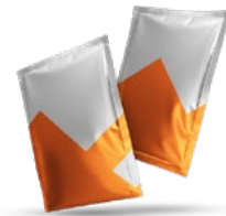
3 sided & 4 sided seal