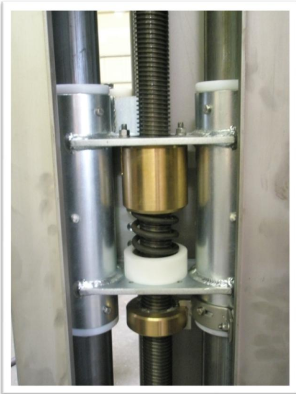
2" Diameter Heavy-Duty Screw with Safety Nut