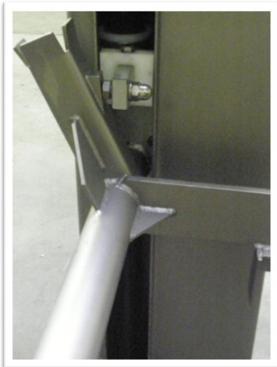
Stainless Steel carriage arm – connects to loader by sliding over hardened CRS machined shaft