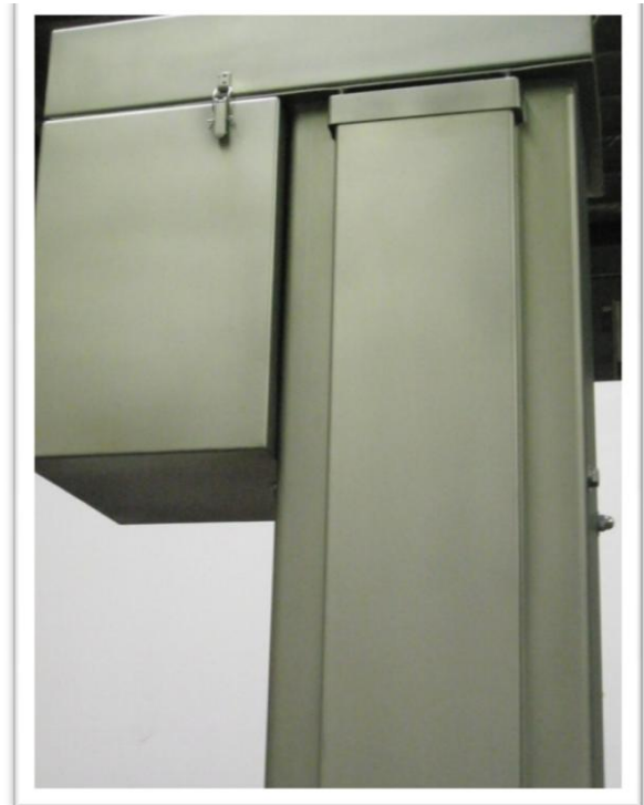
3/16" Thick Column Body – 304 Stainless Steel