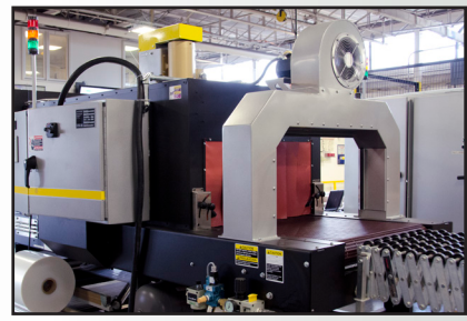
Single Zone Tunnel with Product Cooling

Complete Aftermarket Service & Support for Your Packaging Equipment