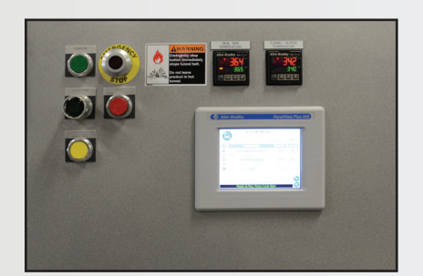
User-Friendly Operator Controls