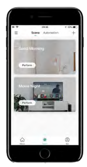
SCENE Set actions to happen at the touch of a button.