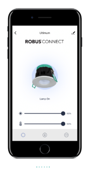
ADJUST LIGHTS Change light settings using a simple interface.