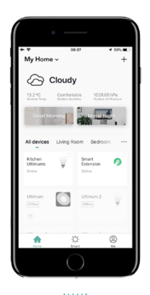
HOME Navigate the app from your home screen.