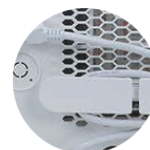
Power cord tidy design