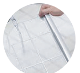
Easy to clean filter