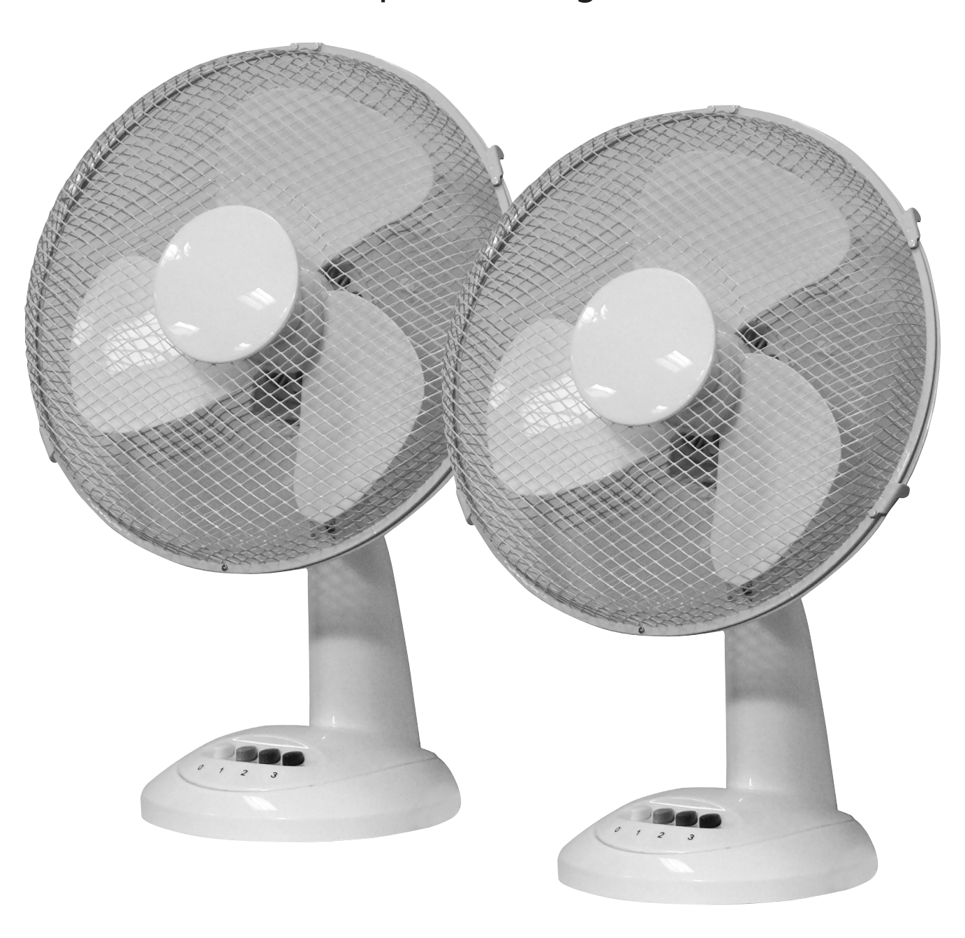
User Manual Please Retain for Future Reference

Prem-I-Air 12" (30cm) White Oscillating Desktop Fan with 3 Speed Settings (PAIR)