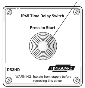
Figure 1 - Front Panel of DS3HD