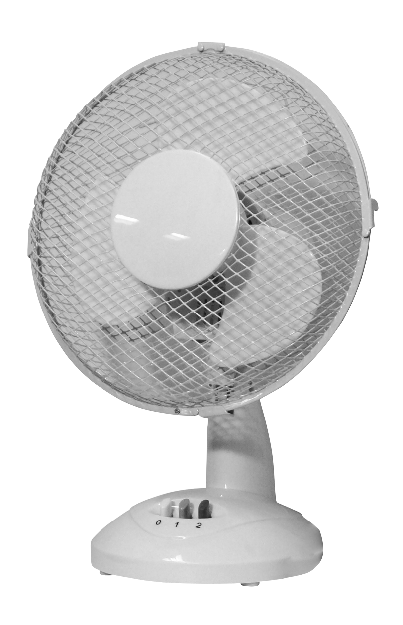
User Manual Please Retain for Future Reference

Prem-I-Air 9" (23 cm) White Oscillating Desktop Fan with 2 Speed Settings