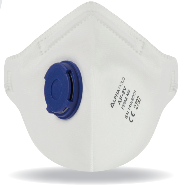
ADJUSTABLE NOSE BRIDGE