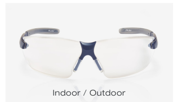
Indoor / Outdoor