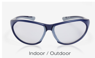
Indoor / Outdoor