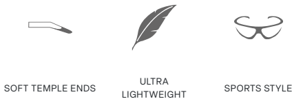
SOFT TEMPLE ENDS