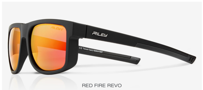
RED FIRE REVO