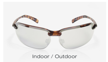
Indoor / Outdoor