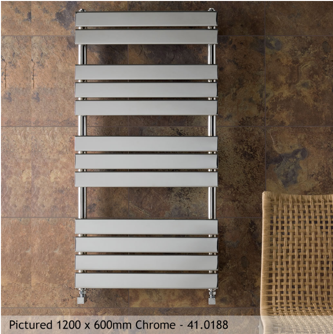
Pictured 1200 x 600mm Chrome - 41.0188