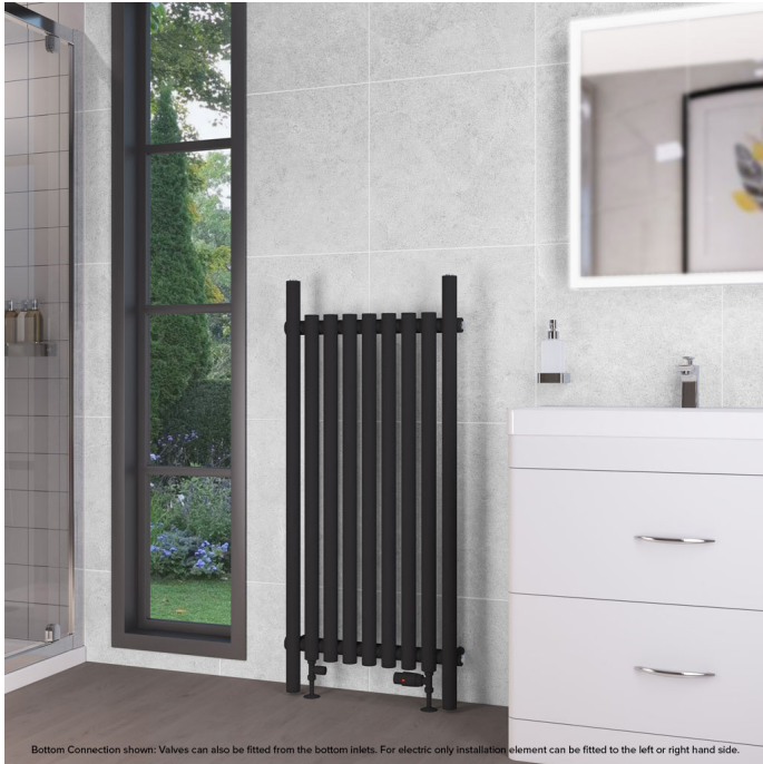
Bottom Connection shown: Valves can also be fitted from the bottom inlets. For electric only installation element can be fitted to the left or right hand side.