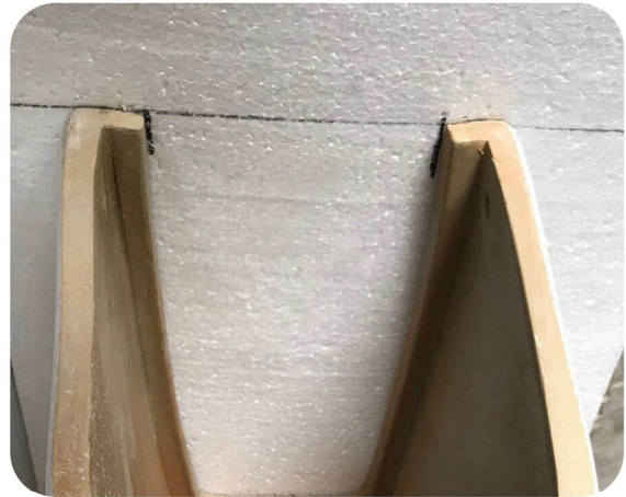
2) Put the semi pedestal on wall and mark the installation sites