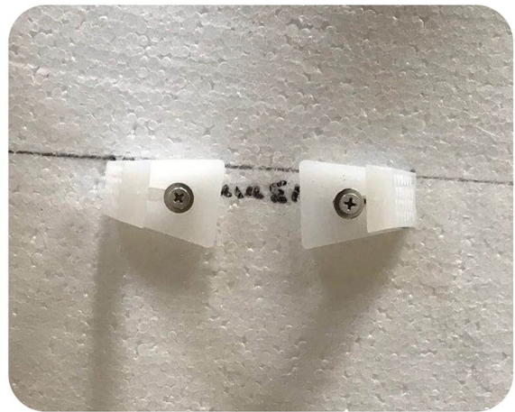
3) Installed the fittings on the marked positions