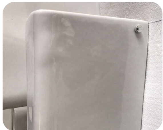
5) Cover the fittings