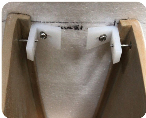
4) Installed the semi pedestal