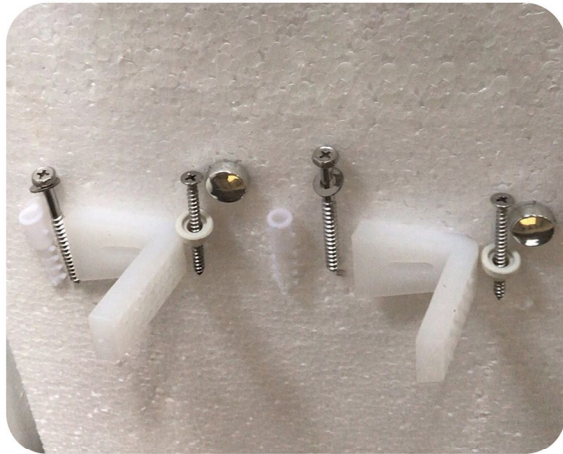
1) Installation Fittings