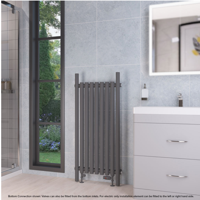
Bottom Connection shown: Valves can also be fitted from the bottom inlets. For electric only installation element can be fitted to the left or right hand side.